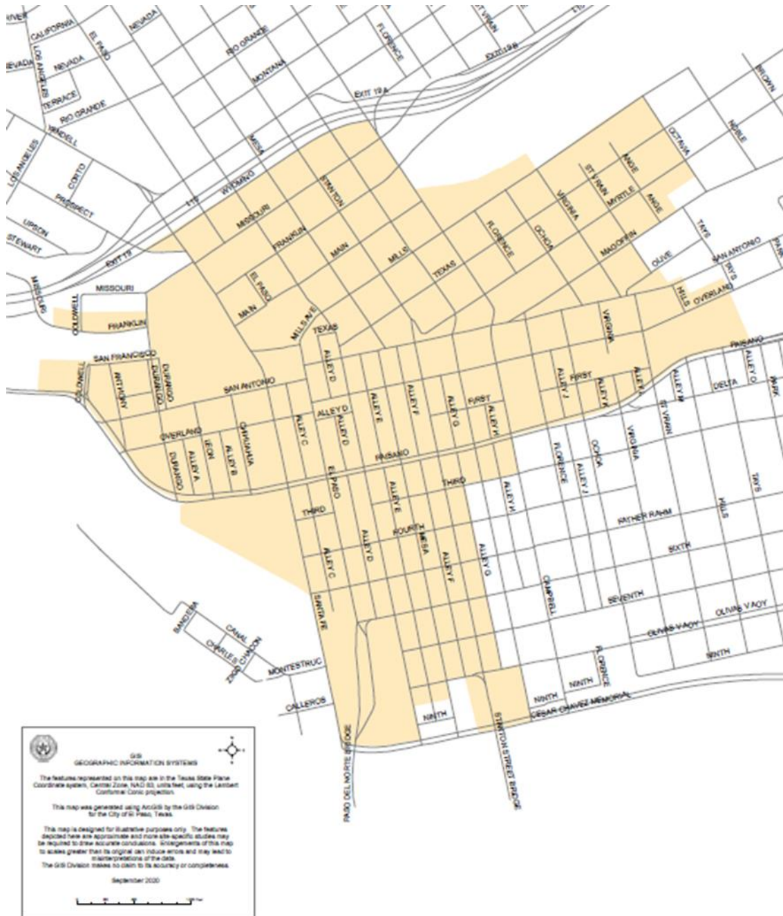
EXHIBIT A - Program Area